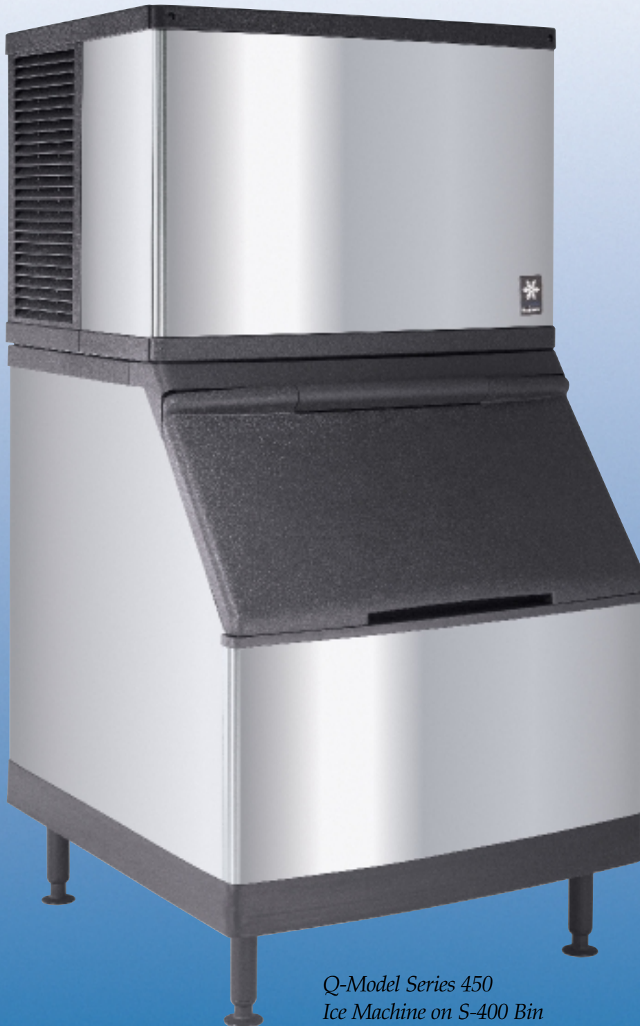
Q-Model Series 450 Ice Machine on S-400 Bin